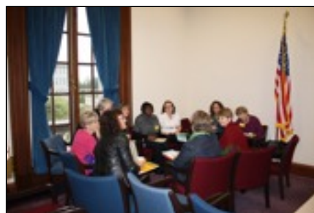
(Above and below.) Participants broke into large and small groups to generate a topic and then walked through a family impact analysis of their selected topic.